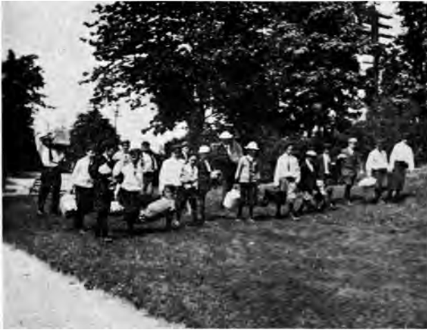
CITY BOYS "HIKING"